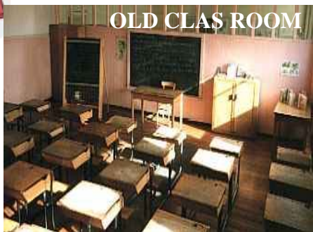
OLD CLASS ROOM